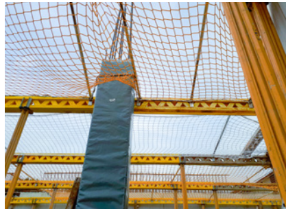
Safe, efficient and fast HAMMOCK is also a safe solution for interference points in the slab area.